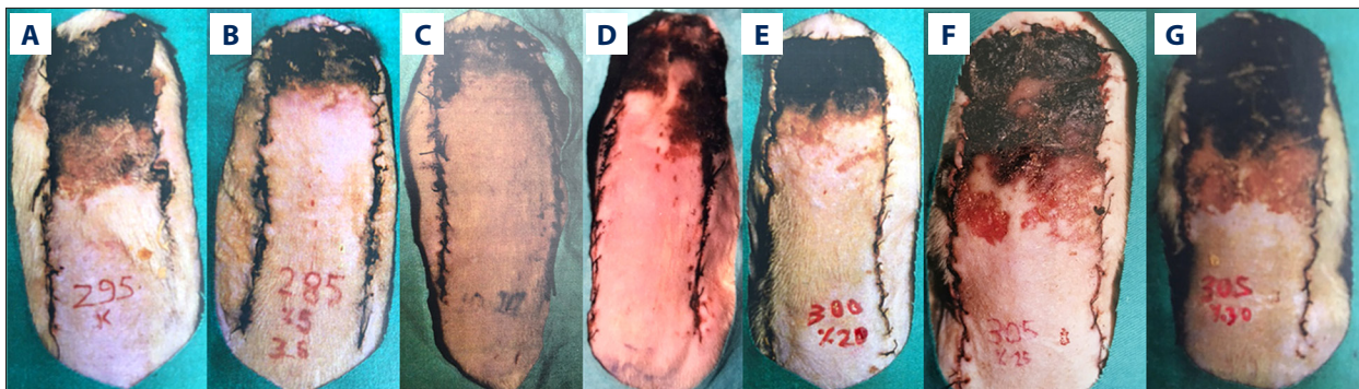
Figure 2. The amount of flap necrosis in (A). Group I, (B). Group II, (C). Group III, (D). Group IV, (E). Group V, (F). Group VI, and (G). Group VII.

templates designed in the same dimensions with the flap were used for marking the necrosis. The ratio of necrosis in skin flaps was measured by the paper template method suggested by Sasaki [16]. The surface of necrotic areas was counted on millimeter graph papers and was calculated in mm 2 . After measurements were performed and biopsies were obtained from the transitional zone of necrosis area, the animals were sacrificed using an overdose of KCl solution.