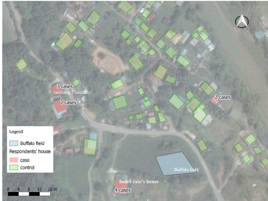
FIGURE 1. The location of the respondents' houses during the case-control study and the buffalo field which is one of the breeding sites for vector mosquitoes. This figure appears in color at www.ajtmh.org .

with crude OR = 5.2 [95% CI: 1.2; 22.3] and employment as rubber tappers with crude OR = 4.7 [95% CI: 1.2; 18.8]. However, after adjusting with other variables, only one factor was significant, that is, living nearby stagnant water with adjusted OR = 7.3 [95% CI: 1.2; 43.5] (Table 2).