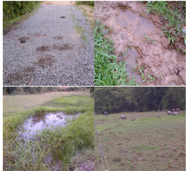
FIGURE 3. Clockwise: The road toward the buffalo field. Water pools in the buffalo field. A small pond situated in the buffalo field. The buffaloes are grazing in the buffalo field. This figure appears in color at www.ajtmh.org .

* Permanent indicates houses constructed by brick, concrete, and other durable materials, houses constructed by other than these materials are designated as temporary.