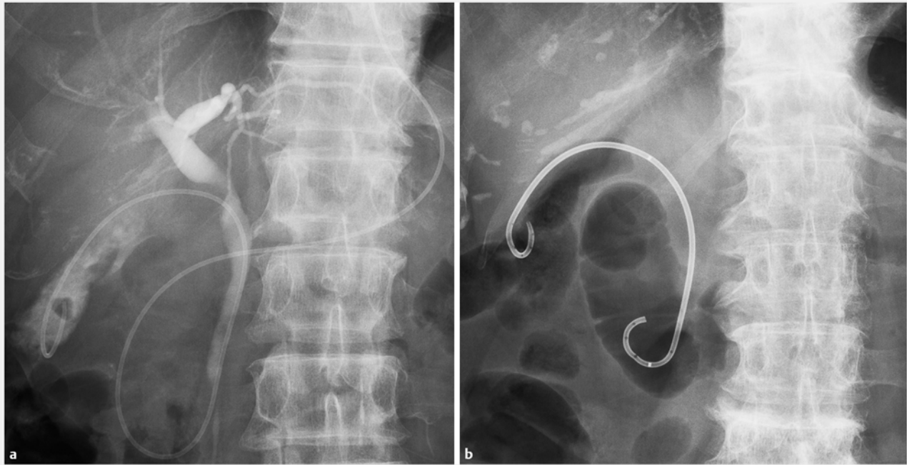
► Fig. 2 X-ray images of a endoscopic nasogallbladder drainage and b endoscopic gallbladder stenting.