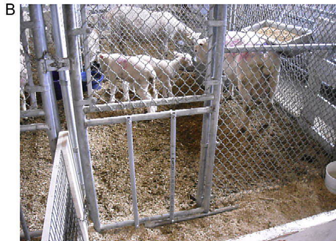
Fig. 1. Diagram of housing (A) and photo of ewe and lamb housing (B).

weights were recorded once a week using a Tru-Test AG350 Indicator animal scale (Tru-Test Distributors Limited, Pakuranga, New Zealand) for ewes and lambs weighing over 10 kg and using a OHAUS ES Series data ranger scale (Ohaus Corp., Pine Brook, NJ) for lambs weighing less than 10 kg. Milk samples were also taken once a week, stripping the teats before taking each sample. Lambs were not separated from ewes except during the milk collection period. Milk samples were analyzed for percent fat, true protein, lactose and total solids using Milkoscan/Fossomatic equipment. The Milkoscan use Fourier Transform Infrared Spectroscopy (FTIR) technology for the determination of milk components. Feed samples were tested for dry matter (DM), crude protein (CP), net energy for lactation (NEL), acid detergent fiber (ADF), neutral detergent fiber (NDF), total digestible nutrients (TDN), lignin, Ca and P using near infrared reflectance spectroscopy (NIR).