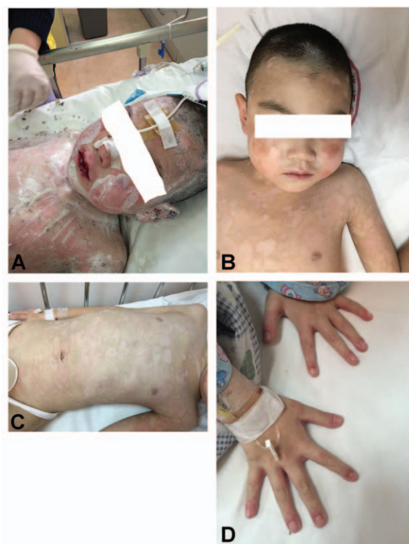
Figure 4. Nursing has affected part of skin, especially his eyes and oral mucosa.

Even after clearing the blood scabs, lips and eyes were still exudated forming new blood scabs because of serious mucosal involvement. Therefore, when removing the blood scabs, first an oil agent was used gently to soften the scabs, preventing forced removal of the scab and avoiding any new injury to the mucous membrane of the skin. As friction material can easily cause the skin to burst, the skin was daubed with zinc oxide to protect it before removing the scab. In the whole process of the treatment,