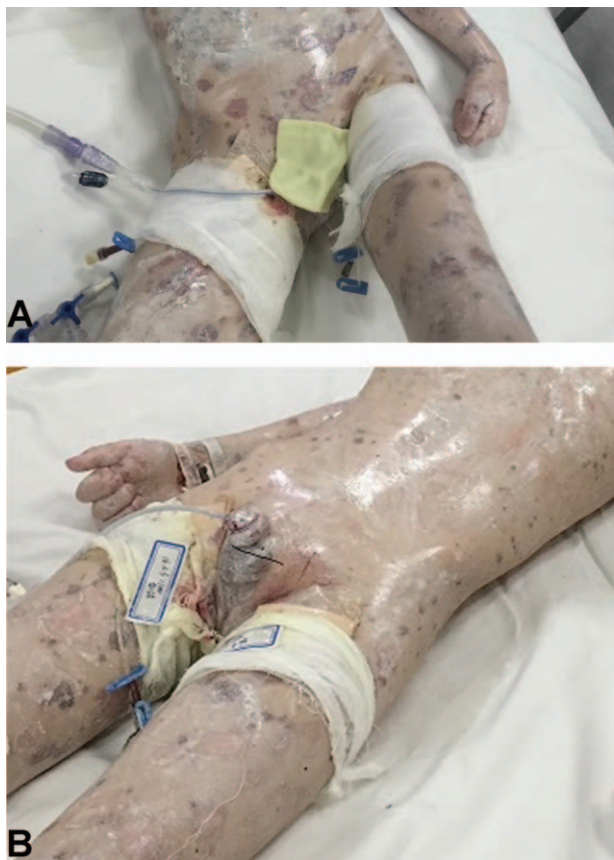
Figure 3. It showed how to fixed CVCs with the sterile gauze. CVCs=central venous catheters.

injection 16,000 U, lidocaine injection 5 mL, and sterile water 200 mL to clean the mouth 3 times a day; and self-made zinc oxide oil solution (made in Xinhua Hospital, Shanghai, China) and other medicines to cure his infection (Fig. 4).