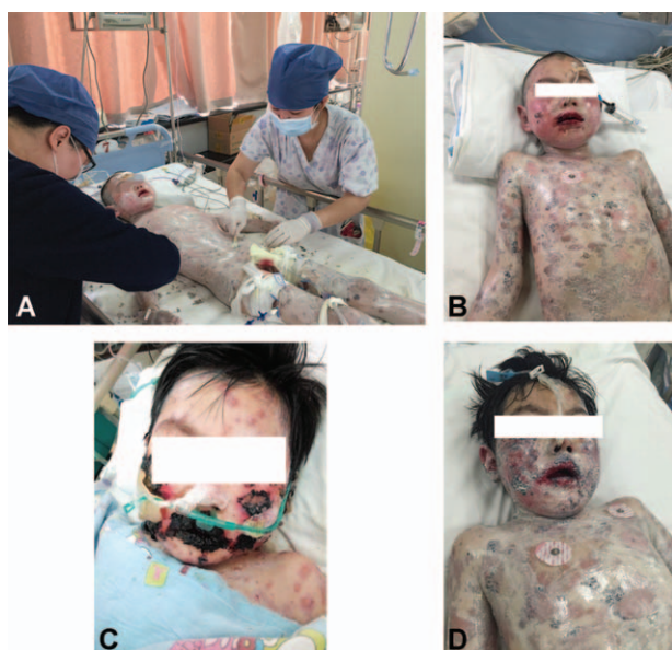
Figure 5. After treatment, the old skin rashes fell off, and he gradually recovered.

ventilatory function is affected by the peeling off of the respiratory tract mucous membrane. After cure, the scars would be formed on the skin due to mucosal damage and inflammation. [13] The oral and systemic skin in the process of the disease can be characterized by serious mucosal lesions and can cause severe pain at every treatment and nursing, which impacts both physiologically and psychologically. SJS has been considered a late-onset allergic reaction and can cause serious long-term sequelae and high mortality rate. Studies have reported a recurrence of the disease to a certain extent in children, and in adolescents, the recurrence rate may be higher than that in smaller children. [14]