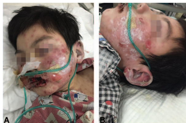
Figure 2. Treatment with indwelling gastric tube and oxygen absorbing by nasal trachea.

The child had eating difficulty; therefore, he was on indwelling gastric tube support to supplement enough energy to guarantee enteral nutrition intake. He was fed compound amino yogurt. He was given oxygen uptake with a nasal catheter of 2L/min to ensure compliance with oxygenation.