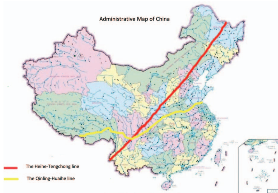
Figure 2. The map was created by Photoshop CS6 (URL: adobeid-na1.services.adobe.com) made by author CS, which is permitted to publish under an Open Access license by its copyright owner (Permission Document). The Heihe-Tengchong line and the Qinling-Huaihe line. The Heihe-Tengchong line is a line from Heihe in Heilongjiang province to Tengchong in Yunnan province. China was divided into south and north by the Heihe-Tengchong line. It was raised by geographer Weiyong Hu in 1935. The east has a more developed economy and degree of civilization than west. The Qinling-Huaihe line is along the Qinling Mountains. The Qinling Mountains are the barrier and boundary separating the climates of both northern and southern China; they are the highest mountains in central-western China. Natural conditions, agricultural production mode, geographical features and people's life styles greatly differ between the south and north of the Qinling-Huaihe line.

2.2.4. Statistical analyses. In our study, LBW was a dependent variable. In single-factor analysis, the \chi^2 test was used to analyze qualitative data, the independent sample t test and 1-way analysis of variance were used for quantitative data analysis. We also calculated the Spearman rank correlation coefficient for correlation analyses. Stepwise multivariate logistic regression was performed in multifactor analysis. Odds ratios (ORs) and 95% confidence intervals (CIs) were estimated by use of both univariate and multivariate analyses. P < .05 was considered statistically significant. SAS 9.4 statistical packages were used for data analysis.