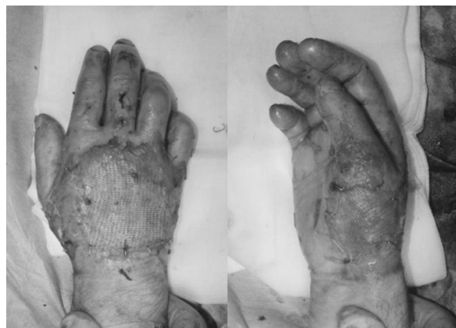
Figs. 4 and 5 - Day 32 following conservative wound care: the dermal burns epithelialized spontaneously and the non-healing full thickness areas were scraped and grafted with a partial thickness skin graft.