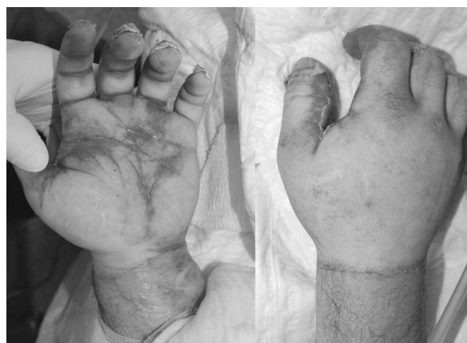
Fig. 1 - A 29-year-old patient admitted with hand burns caused by fire. Clinically, the hand was diagnosed as an FT burn upon admission. It was severely swollen with tight, insensate skin. Compartment pressure was 26 mmHg. Current SOC dictates such cases undergo escharotomy followed within three days by surgical debridement and skin grafting.

Following signing of an informed consent form (ICF), burn etiology, treatments prior to admission, and general description of the burn wound (locations, %TBSA, burn depth, description of the eschar) were recorded. Photographs of the burn wounds were taken prior to and after cleansing/blister removal and wound characterization ( Fig. 1 ), and before and