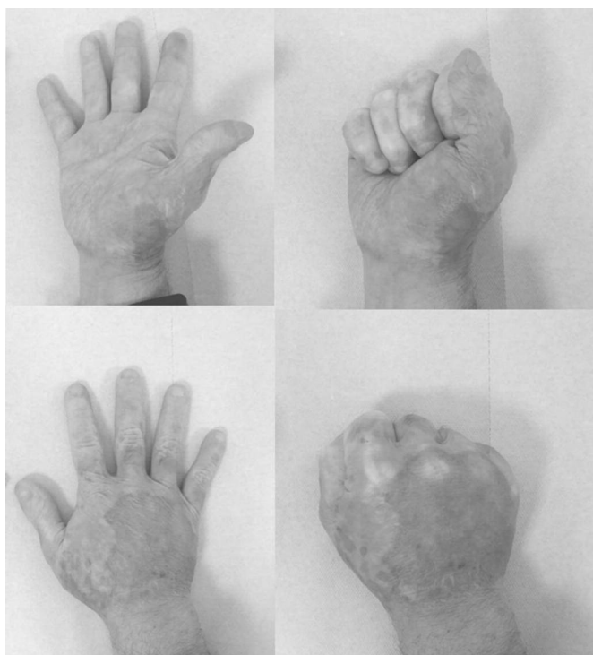
Fig. 6 - Six months post injury: full range of motion and function, good cosmesis aside from minor pigmentation irregularities.

dermis which would then have the potential for spontaneous epithelialization with less need for autologous skin grafting. FT wounds on the other hand always need to be autografted regardless of the debridement technique) and the area grafted (as a % of the wound TBSA).