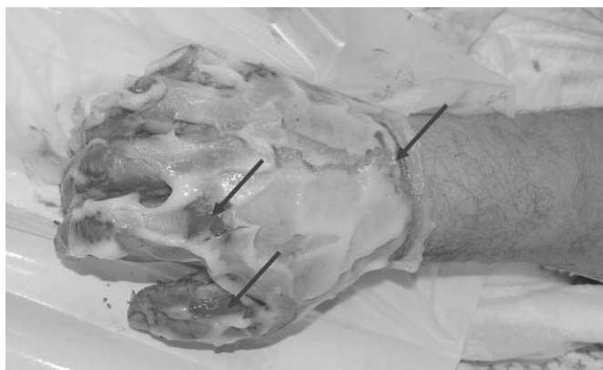
Fig. 2 - NXB applied onto the burned areas, a few seconds later minimal bleeding appears on the edges (arrows).