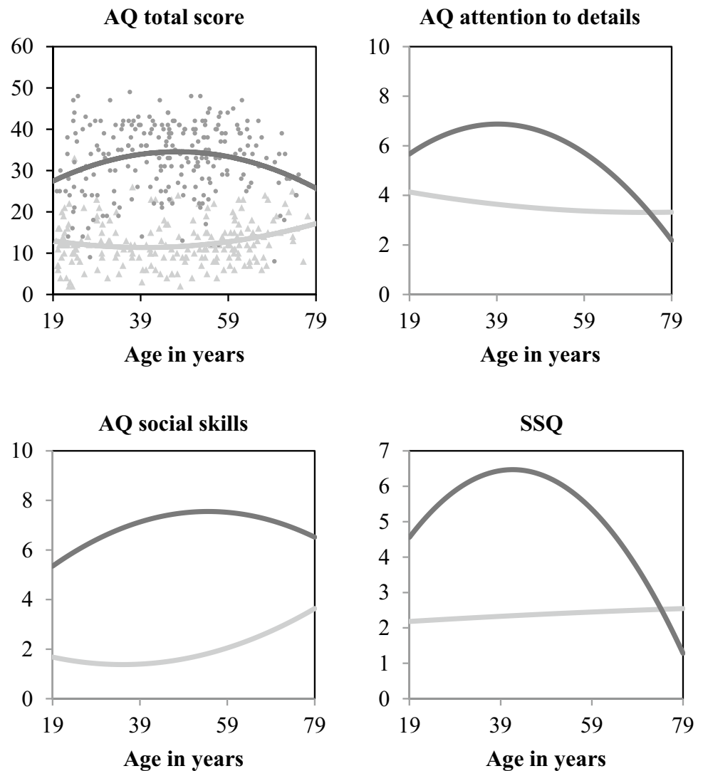
Fig. 1 Age-related differences on the AQ total score, AQ social skills subscale, AQ attention to detail subscale, and SSQ. The darker line and dots indicate the group with autism spectrum disorder