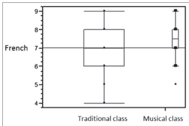
Fig. 3. Comparison of the French marks demonstrates significantly better results in special courses than in traditional courses ( p = 0.0003 ).

training appear to have a greater success in foreign language learning. Our results are in agreement with Finnish studies by Milovanov et al. 13 about this subject. In a recent review, these authors analysed the neuropsychological and electrophysiological aspects related to music in relation to second language linguistic abilities 14 . They assumed that a better ability to discriminate sounds, typical of individuals with a greater propensity to musicality, predisposition to a better recognition and offering a greater possibility to acquire foreign languages with correct pronunciation. The same authors carried out a study