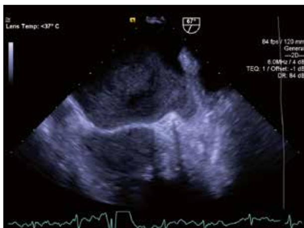
Figure 3. Transesophageal echocardiographic evaluation. See the presence of a thrombus in left atrial appendage.