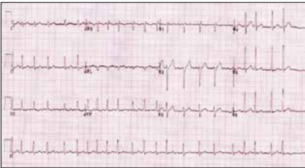
Figure 1. Atrial fibrillation detected by standard 12-lead electrocardiogram.

She referred a recent onset of palpitations and dyspnea. Standard (12-lead electrocardiogram) ECG confirmed the diagnosis of atrial fibrillation with a mean ventricular rate of 160 bpm (Fig. 1). PM interrogation showed atrial high rate electrograms (AHRE) faster than 220 bpm, that lasted longer than 5 minutes with irregularity and incoherence of RR intervals (Fig. 2) and arose five days before the cardiologic evaluation. Transthoracic echocardiogram showed a slightly reduced left ventricular systolic function (Simpson's biplane ejection fraction: 48%) and a mild left atrial enlargement (left atrial volume index: 29 mL/m 2 ). Considering the patients' symptoms and the need to restore sinus rhythm before surgical procedure, a TEE-guided DCC was performed, which showed the presence of a thrombus in left atrial appendage (Fig. 3). The patient started a beta-blocker therapy for rate control (bisoprolol 2.5 mg/die) and oral anticoagulant therapy (warfarin 5 mg/die) to dissolve the thrombus and prevent