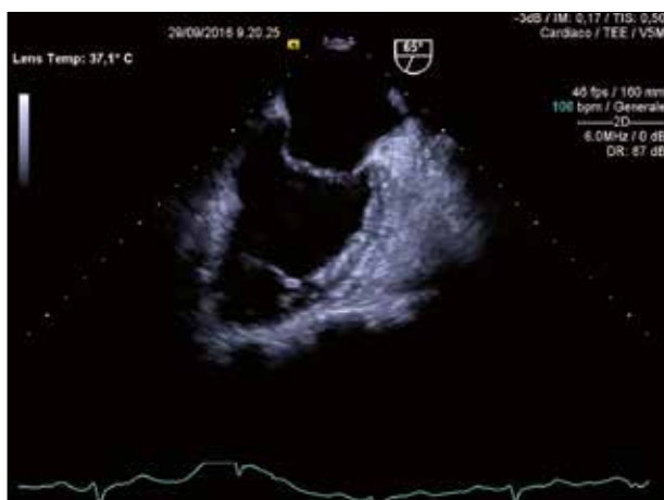
Figure 4. Transesophageal echocardiography evaluation eight weeks after treatment with dabigatran etexilate.

to sinus rhythm; however, it carries an inherent risk of stroke, which is substantially reduced by the administration of anticoagulation therapy. An early initiation of such therapy is important in all patients scheduled for cardioversion. Patients who have been in AF for periods longer than 48 h should start oral anticoagulation therapy at least 3 weeks before cardioversion and will continue it for at least 4 weeks afterwards (31). However, the difficulties in achieving an optimal anticoagulation with conventional warfarin therapy, likely related to several factors such as the slow onset of action, variable pharmacologic effects, numerous food and drug interactions and periodic closely target INR monitoring (32) make it difficult the therapeutic management in clinical practice and reduce the real-life patients' compliance. All these challenges have prompted an extensive research and developed NOAC,