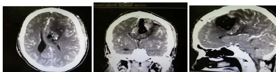
Fig. 2 Postoperative CT with contrast of case no. 5, group B

Based on their dural attachments, parasagittal meningiomas are considered as lesions attached to the superior sagittal sinus, while parafalcine meningiomas arise from falx and concealed completely by the overlying cortex, and typically, they do not involve superior sagittal sinus. Incidence of parasagittal meningiomas varies