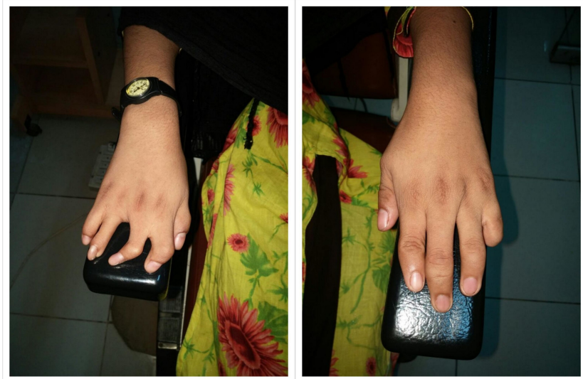
FIGURE 4: Musculoskeletal anomalies released syndactyly in right hand, auto-amputation of little finger in left hand, and brachydactyly in both hands.