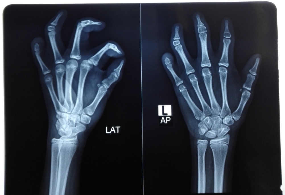
FIGURE 5: X-ray images of the skeletal abnormalities