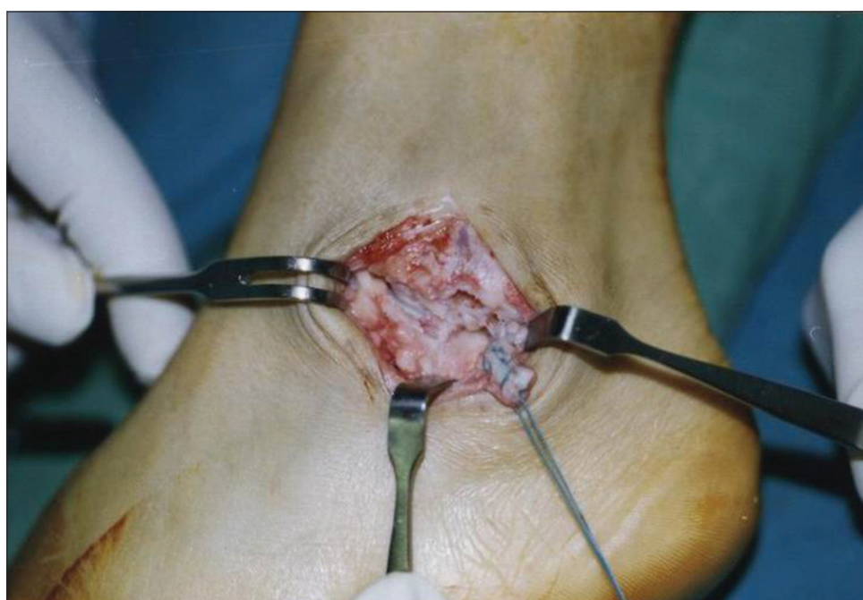
Figure 2: Peroperative photograph showing calcaneofibular ligament was advanced with the Bunnell suture technique. A short bony tunnel along the original calcaneofibular ligament axis was created from the fibular attachment of the calcaneofibular ligament using the 2.0-mm, 3.0-mm, and 4.0-mm drill bits

The ankle was immobilized with the posterior splint for 2 weeks and maintained in a nonweight bearing position. After removal of the wound dressing and sutures, a short leg-walking splint was applied, and active range of motion exercises were performed for the treated ankle for another 4 weeks. At 6 weeks postoperatively, the walking splint was removed and the ankle was protected by a soft orthosis. Physiotherapy, including proprioceptive training, progressive strengthening, and flexibility exercises were then initiated. Three months postoperatively, patients were allowed to practice straight line running and gentle jogging with a soft brace. Patients were allowed to participate in a full range of sports activities by 6 months postoperatively; however, the use of an ankle support during heavy exercise, such as while playing basketball or tennis, was advised for an additional 6 months.