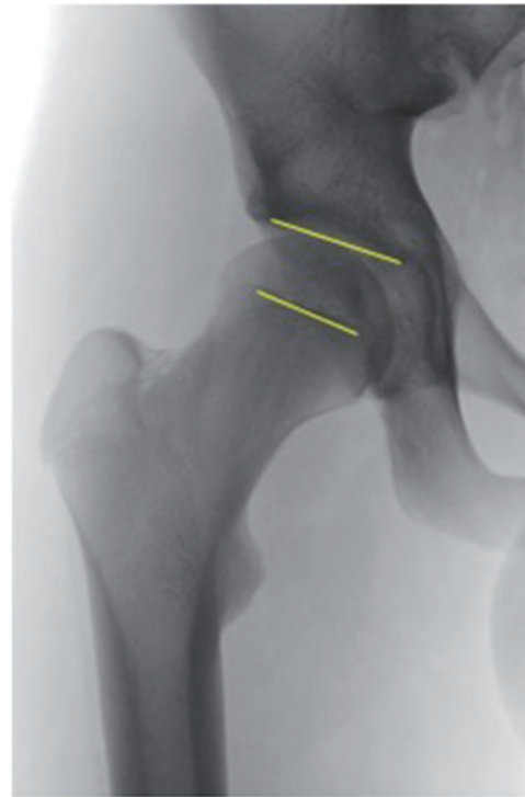
Fig. 2. The FEAR index. The angle is measured between a line connecting the most medial and lateral point of the sourcil and a line connecting the medial and lateral end of the straight part (usually central third) of the physeal scar of the femoral head. A negative FEAR index, with the angle opening medially as shown in Fig. 3a, indicates a stable hip.

The FEAR index is a recently described parameter that seems to have a high value to predict stability of the hip [27]. It is formed by the angle between the acetabular roof and the central third of the femoral growth plate (Fig. 2). It is based on the fact that during growth the epiphyseal growth plate of the femur orients itself perpendicularly to the joint reacting forces of the hip. Growth and the orientation of the femoral neck are under the control of the sub-capital growth plate [31]. Pauwels and Maquet [32] theorized that the resultant force acts from the center of the epiphyseal cartilage and that during growth, the epiphyseal plate orients itself perpendicular to the joint reaction force in accordance with the Heuter–Volkman principle. Pauwels and Maquet's theory later was confirmed by Carter et al. [33] who studied the influence of hip loading by bi-dimensional finite element analysis.