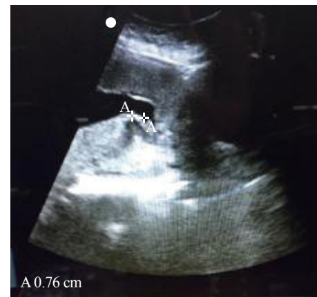
Figure 1. Low lying placenta (placenta measuring less than 2 cm away from the internal os).

circumference with respect to fetal gestational age. One patient in this study (Patient 23, Table 1) was found to have an infant measuring 8 weeks behind the expected age based on her LMP. Although this could be due to the patient having incorrect dating based on her LMP, this discrepancy could also identify a high-risk pregnancy such as intrauterine growth restriction which would require closer monitoring. This woman was thus referred for additional testing and a higher level of