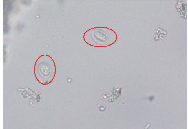
FIGURE 2: Stool examination showing cysts of Giardia lamblia (red circles).

endoscopy performed one month after discharge showed significant improvement in the lesions of ileo-cecum and colon. We followed up this patient for about three years, and found no recurrence, and the stool examination revealed an absence of G. duodenalis . A definitive diagnosis of intestinal giardiasis was confirmed again.