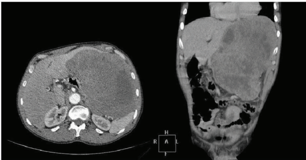
FIGURE 2: Contrast-enhanced computed tomography showing wide hypodense mass in the left hemiabdomen.

and heterogeneous absorption. The mass was posterior to the stomach and adjacent to the spleen and left kidney, without a cleavage plane between the left lobe of the liver and the pancreatic body, also compressing adjacent organs, invading the posterior wall of the stomach. The patient also underwent upper digestive endoscopy, showing bulging and gastric mucosal edema.