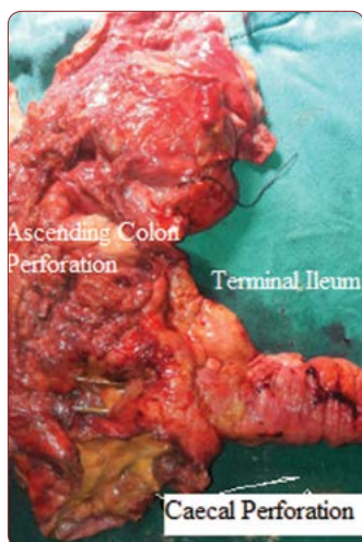
FIGURE 3. Resected specimen with caecal perforation