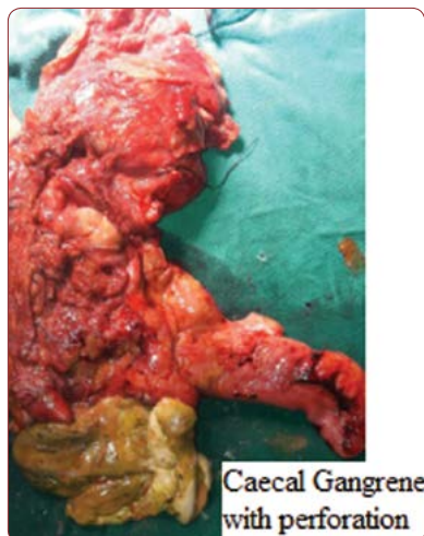
FIGURE 2. Resected specimen of right hemicolectomy with caecal and ascending colon perforation