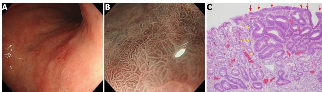
Figure 1 Gastritis-like appearance. A: White light image by conventional endoscopy. Slightly reddish depressed lesion is detected in posterior wall of the upper part of the corpus; B: A gastritis-like appearance under narrow-band imaging under magnifying endoscopy; C: Well-differentiated tubular adenocarcinoma with low-grade atypia (HE, orig. mag. \times 100 ). Note the non-neoplastic epithelium (arrows) partially covered the surface of the adenocarcinoma (arrowheads).

NA: Not applicable; ESD: Endoscopic submucosal dissection.