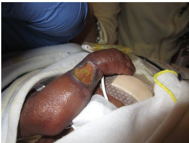
Fig. 2. A 32-week premature infant with a dopamine extravasation 2 months post infusion.

Vasoconstriction occurs via an \alpha -1-mediated response, with norepinephrine being the most commonly reported cause of vasopressor-mediated infiltration. 14 Dopamine and epinephrine ( \beta -1, \beta -2, and \alpha -1 agonist) also function on \alpha -1 receptors. Phentolamine may serve as a local therapy/reversal agent in these cases 23,24 (Figs. 2, 3). In a study of 734 patients receiving peripheral intravenous vasopressors, there was a 2% incidence of infiltration. 25 In all cases, local phentolamine was injected in addition to application of a nitroglycerin paste, and no patients experienced irreversible tissue necrosis. In contrast, vasopres-