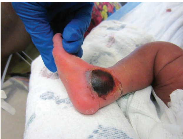
Fig. 5. A 3-month-old infant with a TPN infiltrate 1 week post infusion. Treated with hyaluronidase and elevation.