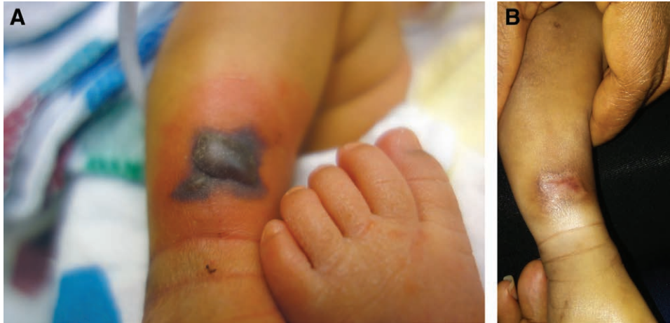
Fig. 3. A, A 5-day old full-term neonate with an R lower leg IV extravasation; dopamine and PPN were infusing. Treated initially with phentolamine and elevation. B, 30-day Status post healing by secondary intention, with residual cosmetic skin changes.