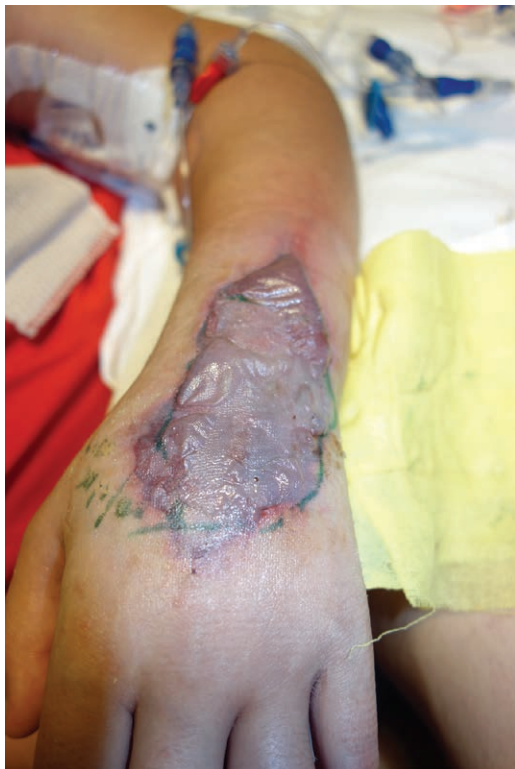
Fig. 1. A 11-year-old female with dopamine extravasation 5 days post infusion. Treated with warm compress and phentolamine.