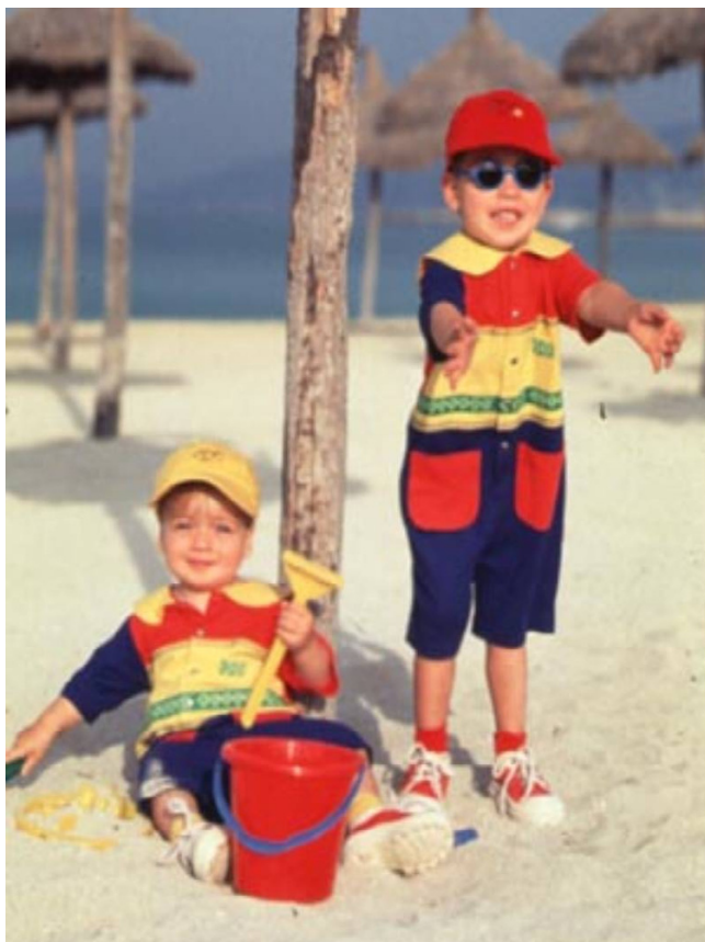
Figure 3 Example for a collection of sun protective clothing for children. The design of these clothes fulfills the requirements of the forthcoming European standard [4]