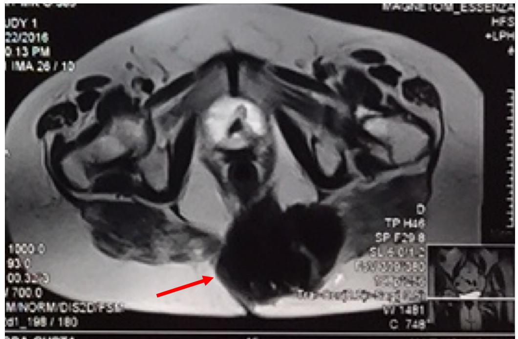
FIGURE 1: Computed tomography (CT) of the pelvis showing well defined heterogenous lesion in coccygeal region (red arrow) extending into pre- and postcoccygeal compartments in midline and left para midline 84 x 85 x 89 mm in dimension. Few foci of calcifications are noted.

with a corresponding destruction of the coccyx. Contrast computed tomography (CT) of abdomen and pelvis revealed a heterogenous lesion of soft tissue density in the midline and left paramedian region of the coccyx (extending into pre- and postcoccygeal plane) measuring 8.4 x 8.9 cm as seen in Figure 1.