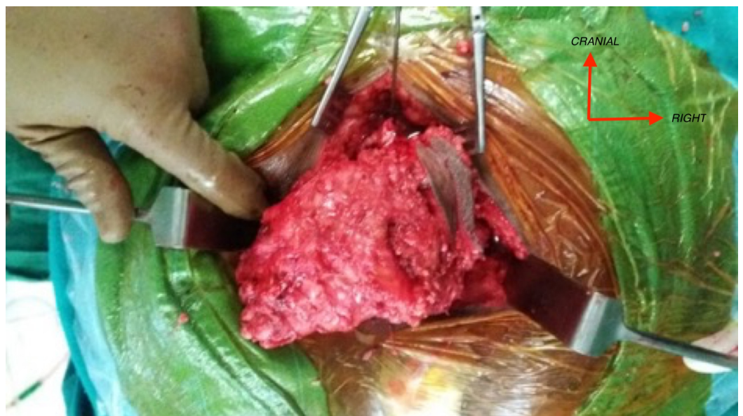
FIGURE 3: Intraoperative images of tumor resection. The tumor appears well circumscribed and measured 12.5 x 7.5 x 8.5 cm

A midline vertical incision is made from S3 till few centimeters caudal to the palpable mass. The tumor mass was separated from the surrounding tissues taking healthy margins circumferentially and separating it from skin and fascia laterally and from recto-sacral fascia ventrally taking care of the rectum. The tumor was removed en-bloc as seen in Figure 3 by resecting through the body of S4 vertebrae.