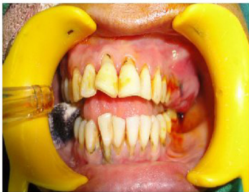
Fig. 4. Shows pre – operative intra – oral view.