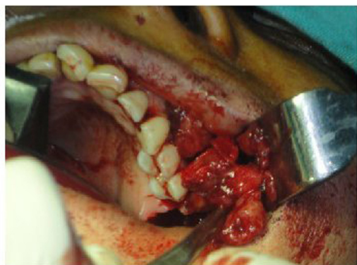
Fig. 5. Shows peri-operative intra – oral view.