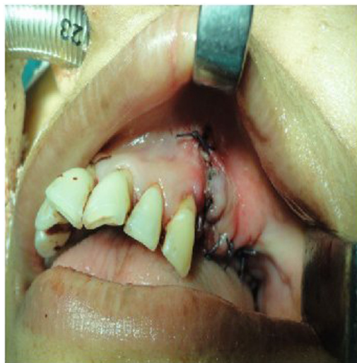
Fig. 7. Shows post-operative intra-oral view after suture.

tinguishable from other giant cell lesions of the bone like cherubis and aneurysmal bone cyst. Giant cell granuloma forms a lobulated mass of proliferative vascular forms a lobulated mass of proliferative vascular connective tissue packed with giant cells. These giant cells are seen lying in vascular stroma [19].