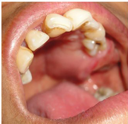
Fig. 1. Swelling in upper left back tooth region wrt 26, 27, 28.