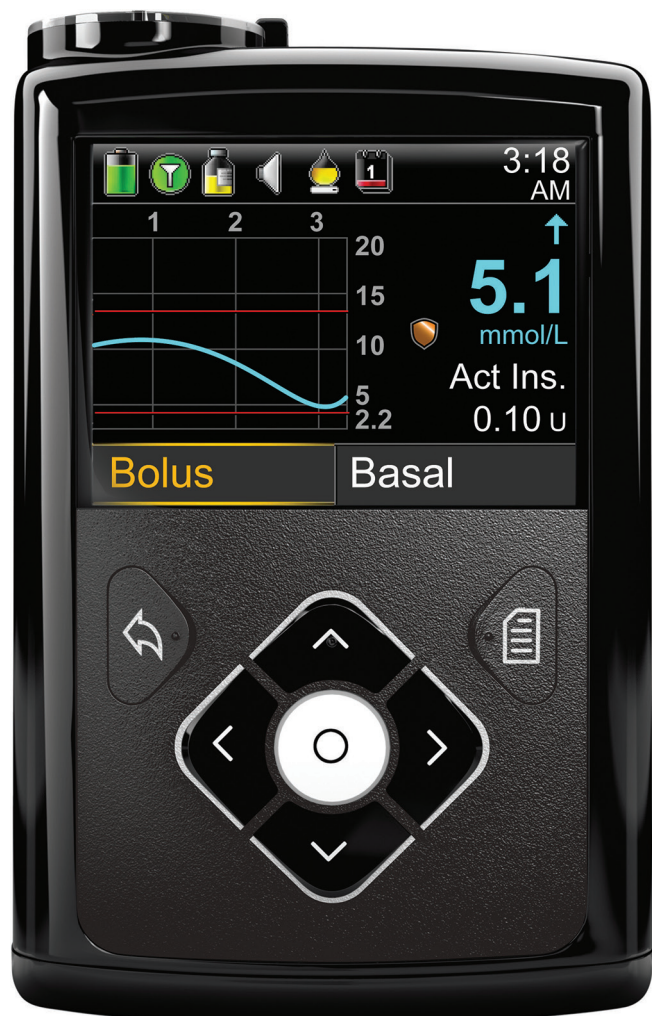
Figure 3 MiniMed 640G (Medtronic, Watford UK).

The REACT recruitment centres are level 3 NICUs. They have been selected either because of their previous experience of using CGM in the preterm infant, or they are centres with a proportionately large number of babies