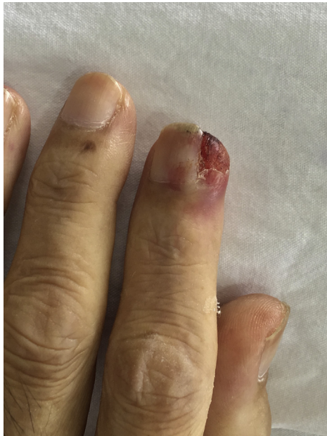
Fig 1. Appearance of the nail change.