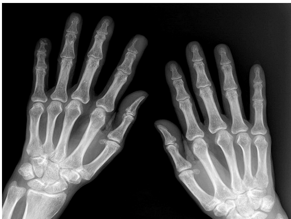
Fig 2. Plain radiograph of both hands shows bone lesion at distal phalanx on the left index.

granuloma-like lesion. 8 Clinical signs are easily mistaken for infections and inflammation such as felon, paronychia, pyogenic granuloma, or rheumatoid arthritis. 9 The distal phalanx of the thumb is the most common site of involvement. 7,9 Malignancies of the lung, gastrointestinal tract, and kidney are often the primary tumors. 7-9 Metastases to the fingers and hands are most commonly from malignancy of the lung, whereas metastases to the toes and feet is most frequently from the genitourinary tract. 10 To our knowledge, there are no previous reports of this condition stemming from a primary tumor of the tongue.