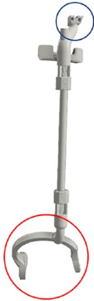
Fig. 3 Illustration of an Embody (Embody, London, UK) patient-specific instrument guide incorporating distant patient-specific referencing for the malleoli (red) and local patient-specific referencing of the proximal tibia exposed by the surgical incision (blue).

component position is planned in a similar manner, according to preference.