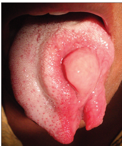
Figure 1: Benign tumor on the dorsum of tongue and the bifid tongue is seen on the left side

tongue was preserved. The excised growth was sent for histopathological examination. Two weeks later, the patient was followed up in the speech clinic to assist in speech and swallowing. The histopathology reported that the mass was predominantly mucous salivary tissue. It showed both mixed and mucous lobules, and the histological diagnosis was a salivary hamartoma. The patient had no recurrences at 1-year follow-up.