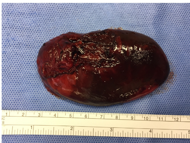
Fig. 3. Post-operative examination of the resected specimen demonstrates a 75 mm long, thin walled gallbladder with extensive areas of necrosis.

fundus measuring 5 mm [Fig. 3]. Microscopically, there was dense neutrophilic infiltrate with areas of haemorrhage and transmural necrosis consistent with acute gangrenous acalculous cholecystitis.