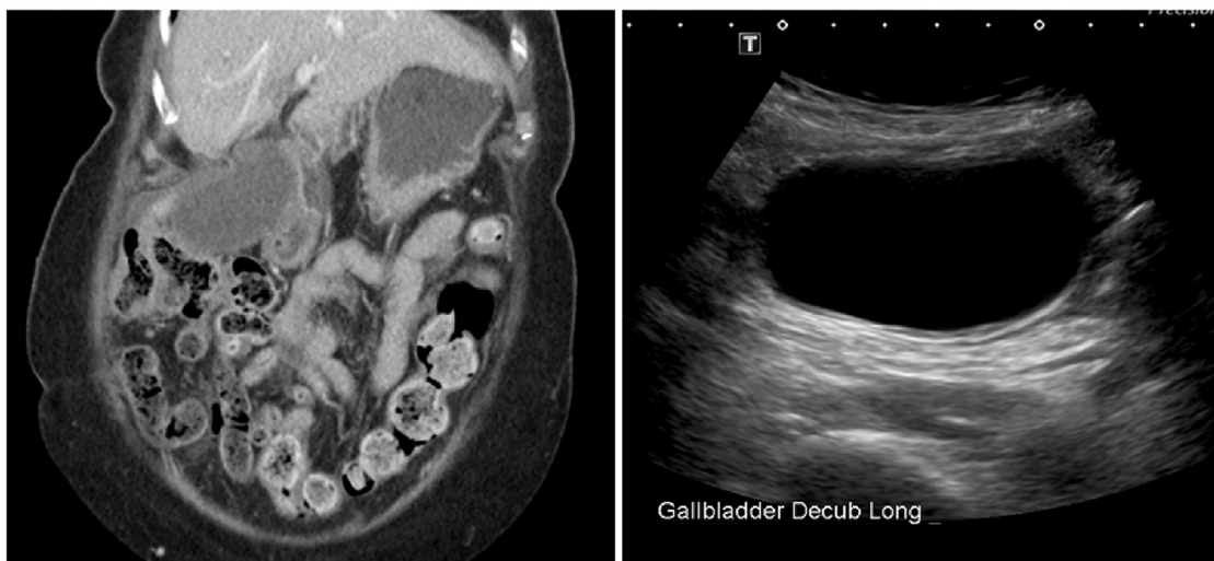
Fig 1. CT Scan at time of admission demonstrates a large, distended gallbladder with normal wall thickness and common bile duct calibre. US scan demonstrating a mildly thickened gallbladder wall with no calculi.