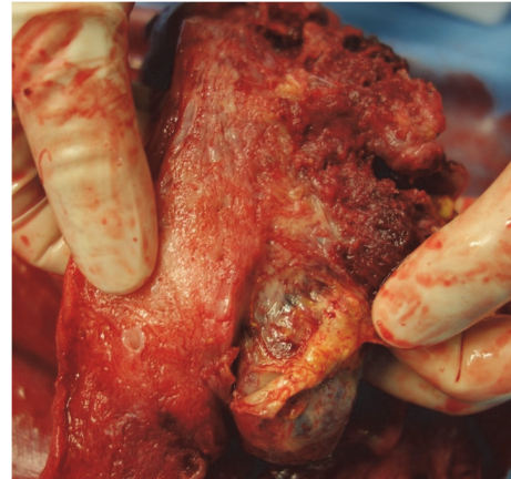
FIGURE 3: Resected uterus: placenta is present from the fundus to the posterior uterine wall. The placenta adheres diffusely to the myometrium, and partial thinning is visible at the fundus.

The placenta adhered to the uterine wall after childbirth and could not be easily separated manually. The blood vessels on the uterine surface at the placental implantation site were engorged (Figure 2), leading us to diagnose the patient with placenta increta. The placenta remained firmly adherent to the uterine wall, and although there was almost no bleeding from the uterine cavity, cesarean hysterectomy was performed after informed consent was obtained from the patient. In the abdominal cavity, 4 cm subserosal uterine