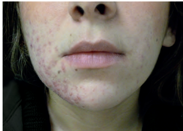
FIGURE 2: Predominance of acne lesions on the right side of the face