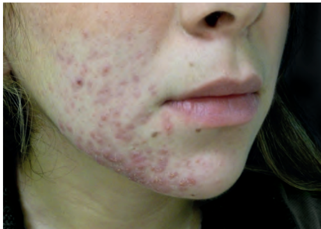
FIGURE 1: Unilateral papules and pustules in the mandibular area