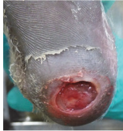
FIGURE 1: 2.5 × 3.5 cm lesion situated in the middle of the weight bearing part of the heel of the foot.

The animal was placed in a prone position. The surgical area was prepared in an aseptic manner. The heel flap operation was performed under tourniquet control. After debridement and reconditioning of the wound, the macroscopically affected part of the calcaneal bone was removed by means of bone rongeur. In the process superficial as well as deep bone biopsies were taken. Histopathologically, the removed part of the calcaneus showed a superficial massive fibrosis mixed with small vessels indicative for mature granulation tissue as well as a sparse infiltration of mononuclear inflammatory cells. A slow-release, self-dissolving gentamycin sponge (Septocoll®E 40, Biomet) was inserted into the resulting bone defect. After localization of the medial plantar artery