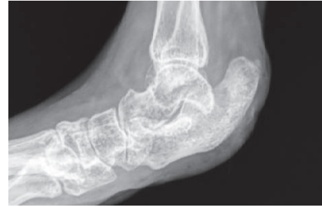
FIGURE 5: Control radiographs (33 days after surgery) illustrating the normalization of the calcaneal bone as well as the soft tissue structures around the ankle joint.

According to Sunderland's classification the injury corresponded to a grade V injury [1]. Histopathology confirmed the expected degeneration of the distal nerve stump consisting of mature fibrous tissue mixed with inflammatory cells. On the proximal stump, traumatic neuroma formation was suspected from macroscopic appearance. Histopathologically, loose neural tissue with the presence of vital axons, Schwann cells, and myelin sheaths embedded in mature fibrous tissue were detected. Reconditioning of the stumps, that is, removal of scar tissue and trimming to healthy fascicular structures, resulted in a gap of approximately 25 mm. Under 2.5 magnification the tibial nerve was dissected. After careful preparation of the fascicles and splitting of the distal nerve stump a turnover flap was formed. The nerve flap was turned over to reach the proximal end of the nerve. This way the integrity of the nerve was reconstructed by means of the "fascicular turnover flap method" developed by Koshima et al. [2]. This technique allowed for tension-free bridging of the defect. Coaptation of the nerve flap was performed using epineurial sutures (Nylon 8.0). The