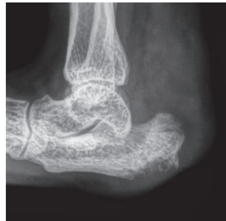
FIGURE 2: Radiographs of the animal’s foot taken 26 days before the surgical intervention.

via Doppler, an adequately sized flap in relation to the animal’s heel surface was dissected around the instep area, to ensure complete coverage of the heel lesion without tension. The neurovascular pedicle was preserved containing superficial branches of the median plantar artery as well as cutaneous branches of the median plantar nerve. The flap was positioned over the defect and attached to the surrounding tissue via continuous subcutaneous followed by continuous intracutaneous sutures (both Vicryl 4.0) and a cutaneous suture (Ethilon 4.0). The donor site was covered by counter transplantation of a full thickness graft from the interdigital webspace in between the digiti pedis I and digiti pedis II of the ipsilateral foot (Figure 3). The graft was fixated via simple interrupted sutures (PDS 5.0).