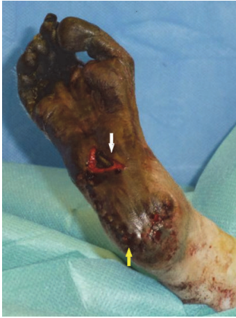
FIGURE 3: Pedicled instep flap (yellow arrow), donor site covered by counter transplantation of a full thickness graft from the interdigital web space in between the digiti pedis I and digiti pedis II of the ipsilateral foot (white arrow).