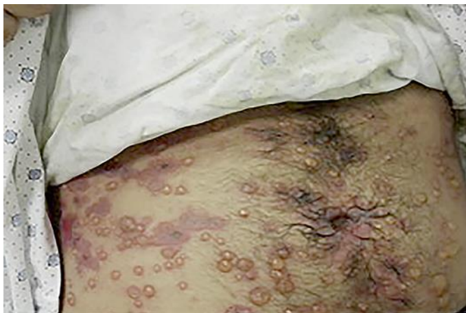
Fig. 1. Diffuse pemphigoid lesions over the abdomen.