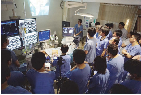
FIGURE 4: In live demonstrations, we perform ablation on various cases: a case of first diagnosed cancer not difficult to ablate judging from its size and location, a case of a tumor beneath the diaphragm requiring artificial ascites, a case of a tumor in the caudate lobe, a case of a tumor adjacent to the heart, a case of a tumor next to portal vein or hepatic vein at porta hepatis, a case of a tumor over 5 cm in diameter, a case of more than five tumors, cases of hepatic metastasis from the colorectal cancer or the gastric cancer, a case of simple nodular type HCC with extranodular growth or confluent multinodular type HCC, a case of a tumor with unclear boundaries on ultrasound which requires contrast-enhanced ultrasound to perform RFA, a case in which a tumor cannot be detected on ultrasound and requires support of fusion imaging, and others. From these cases, we demonstrate the importance of appropriate patient posture, usefulness of our original dedicated probe for interventional procedures and our RFA dedicated operation table, and the way to carry out ablation under contrast-enhanced ultrasound guidance and with multimodality fusion imaging.