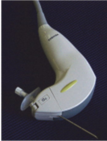
FIGURE 1: We participated in development of a dedicated ultrasonic transducer and have used it in 12,000 procedures of radiofrequency ablation. The dedicated ultrasonic transducer has the following advantages: (1) needle slot is located inside the transducer, (2) a puncture angle of 100 degrees is available in addition to 55, 70, and 85 degrees, (3) the same image is obtained as a regular convex transducer generates, (4) a puncture attachment is unified with the transducer, and (5) it is capable of multimodality fusion imaging.

by repeated surgical resection. In our study, the first recurrence was treated by iterative RFA in 659 (88.9 %) of the 741 patients. In the remaining, transarterial chemoembolization in 69 (9.3 %), systemic chemotherapy in 4 (0.5 %), surgical resection in 3 (0.4 %), radiation therapy in 2 (0.3 %), and supportive care in 4 (0.5 %) were chosen [14]. On the other hand, repeated surgical resection can be an option in only 20-30% of patients with recurrent HCC.