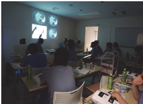
FIGURE 5: In case studies, difficult to ablate cases from participants' institutions are presented and discussed.

and easily repeatable for recurrence. In RFA, outcomes in over 10-year period clearly show that RFA is a curative treatment and enables long-term survival. There are still arguments regarding whether it is proper to perform ablation on resectable cases or not. The number of patients treated by ablation, however, has been increasing. Various innovations would further improve outcomes in ablation. Training programs may be effective in acquiring necessary skills, knowledge, and experience for successful ablation. Sophisticated ablation would be more than an adequate alternative of surgery for small- and possibly middle-sized HCC.