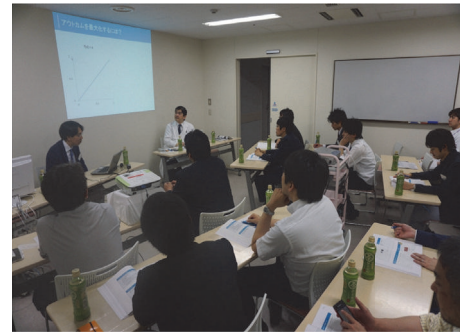
FIGURE 3: Lecture topics are current status of ablation, ablation systems, ultrasound systems, various techniques in ablation, and others.