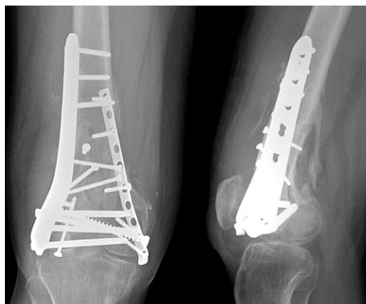
Fig. 7. Radiographs at follow-up of 6 months showing good consolidation.

Extruded bone fragments can be successfully reimplanted to aid in the restoration of leg length and alignment, and preservation of optimum function. But striking the balance between maintaining cell viability and