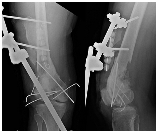
Fig. 5. Post-operative radiographs after initial surgery.