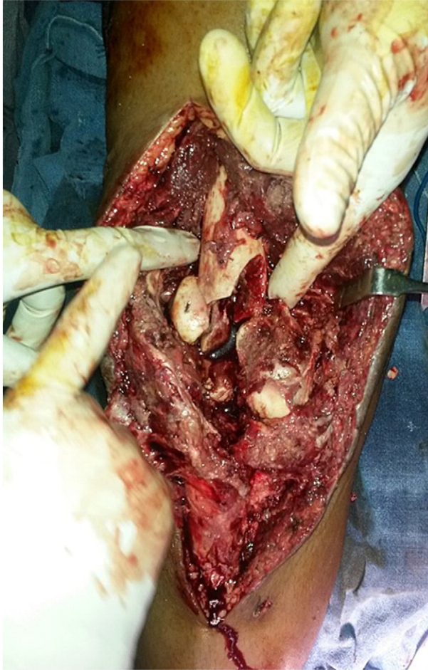
Fig. 3. Intra-operative image showing bone defect.

[7] reported that autoclaving and chlohexidine treatment of bone fragments leave no viable cells, whereas dry povidone-iodine sterilisation leave significantly fewer live cells (21%). Saline and wet povidone-iodine treatment gives more viable cells (77% and 66%, respectively), but wet povidone-iodine could decontaminate only 4 out of 10 samples and saline solution sterilized none. Similar conclusions regarding cell viability and decontamination of bone fragments was published by Bruce et al. [8].