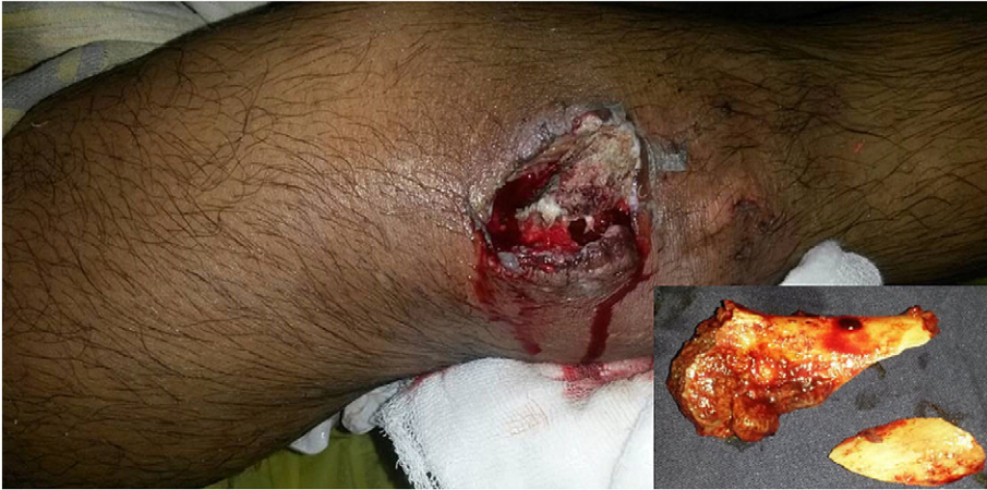
Fig. 1. Clinical image at presentation. Extruded bone fragments are shown in inset.

The free fragments were found to be developing fibrous attachments in the healthy tissue bed. The antibiotic cement spacer was removed and the free fragments were taken out and placed at their anatomical position. The fracture was fixed rigidly with a locking distal femur lateral plate, interfragmentary screws and a 4.5 mm contoured recon plate for medial support. The remaining bone void was filled with cancellous graft harvested from the patient's iliac crest.