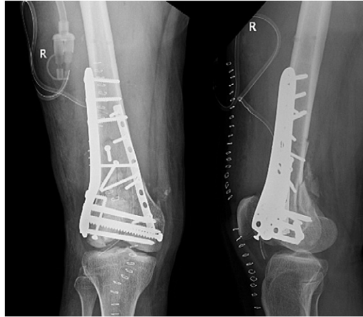
Fig. 6. Post-operative radiographs after second surgery where definitive fixation has been done after placing bone fragments at their anatomical location.