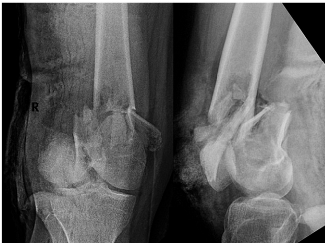
Fig. 2. Radiographs at presentation.

Reimplantation of extruded bone is a risky procedure and in all techniques described previously in the literature, attempts at disinfecting the bone fragments led to a compromise in biology [4,7,8]. Bauer et al.