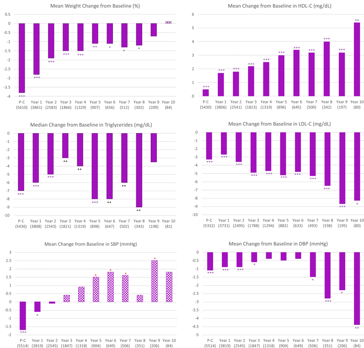
Figure 3 —Changes in secondary outcomes among SDPI-DP participants based on paired data. Means compared with paired t tests; medians compared with signed rank test. Numbers in parentheses in the second row of the horizontal axis are sample sizes. * P < 0.05; ** P < 0.001; *** P < 0.0001. DBP, diastolic BP; P-C, postcurriculum assessment; SBP, systolic BP.

In addition to the practical challenges discussed above, the results of the current study need to be interpreted in light of several limitations. First, due to high attrition rates, our estimate of the crude diabetes incidence and conclusion based on the Cox regression model highly depends on the random censoring assumption, which cannot be verified. As shown in Table 1, participants who did not achieve ≥3% weight loss were more likely to be censored early, which means diabetes incident cases were likely to be underreported in that weight loss group, indicating diabetes incidence rate might