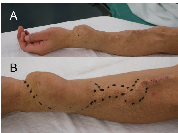
Fig. 1. The picture of the AVF aneurysm of this patient. A: An AVF aneurysm in the left forearm. B: Magnified view of the AVF aneurysm. The extent of the aneurysm is marked. AVF, autogenous arteriovenous fistula.