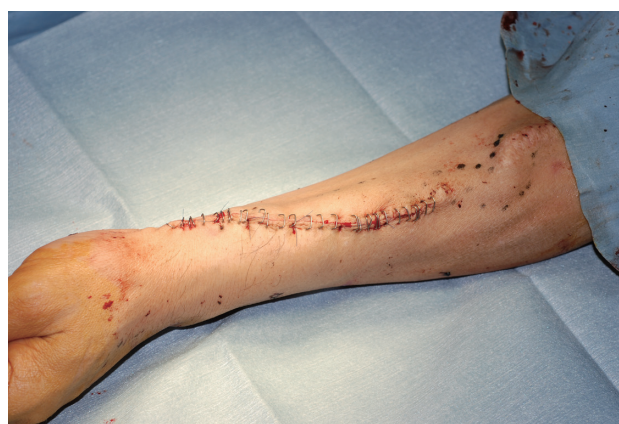
Fig. 4. After the skin closure, the AVF aneurysm completely disappeared. AVF, autogenous arteriovenous fistula.

Ligation of the AVF is an effective method to prevent rupture. However, with this procedure, the functional vascular access must be sacrificed, and the