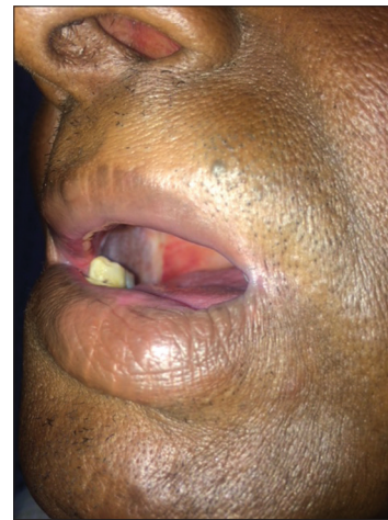
Figure 8: Postoperative 6 months (patient 2)