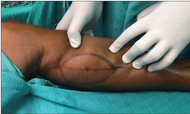
Figure 1: Marking of flap (patient 1)

Between August 2015 and December 2016, 10 free MSAP flaps were used to reconstruct intraoral soft-tissue defects [Table 1]. There were six male and four female patients with the median age of 37.6 years (from 22 to 55 years). All patients had oral SCC. The most common site of tumor resection was the tongue (5 cases), followed by buccal mucosa (3 cases) and floor of mouth (2 cases). Flap failed in one case due to venous thrombosis, rest all nine flaps survived. [Figures 7 and 8]. Failed flap was removed and defect was covered with split-thickness