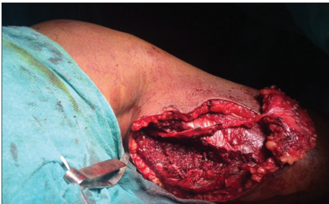
Figure 3: Flap harvest (patient 1)