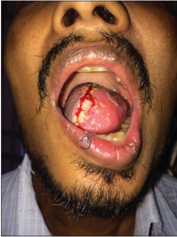
Figure 5: Prick test (patient 1)

from 1.1 to 2 mm and venous diameter of both veins in pedicle ranged from 1.5 to 3.5 mm in size. The number of perforators range from 1 to 3 and 70% flap was based on two perforators. Primary closure attained in all cases.