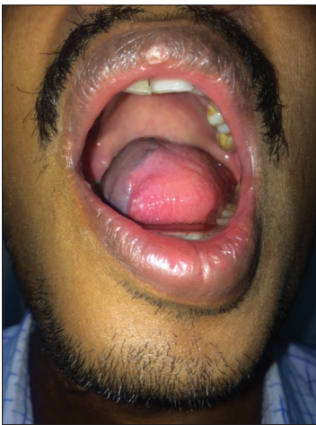
Figure 7: Postoperative 6 months of medial sural artery perforator flap