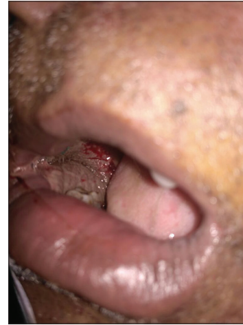
Figure 6: Prick test (patient 2)