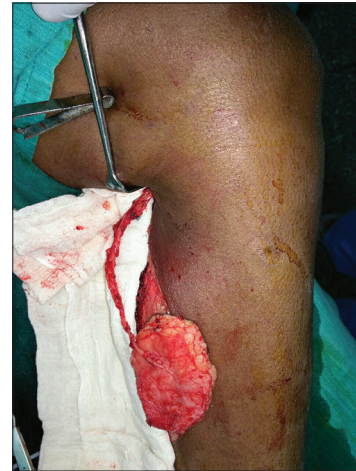
Figure 2: Flap harvest (patient 2)