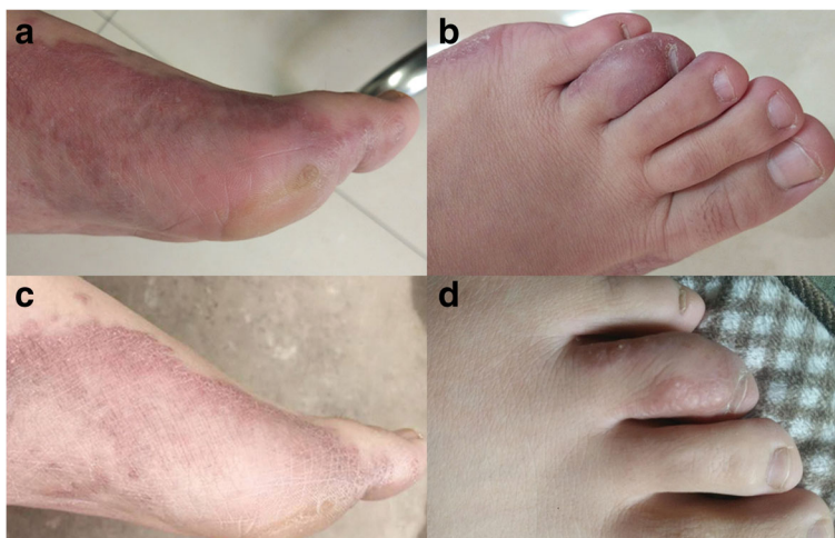
Fig. 1 (a, b) Sole of left foot exhibits erythema, papules, nodules, and scales. The fourth toe dorsum is also infected. (c, d) Foot lesions regressed after 1 month of treatment

We carried out a skin tissue biopsy, which showed multiple granulomatous nodules (Fig. 3a). The Ziehl–Neelsen stain was negative. Periodic acid–Schiff (PAS) and Grocott methenamine silver (GMS) staining were carried out two times. Results were also negative. Biopsy specimens were also inoculated onto two kinds of media: Sabouraud’s dextrose agar (SDA), where one of which contained chloramphenicol and cycloheximide, and the other one contained chloramphenicol only. After being cultured on SDA at 27 °C for 7 days, spreading-woolly-white colonies grew on the inoculation sites of media containing chloramphenicol only and there’s no other colonies grew (Fig. 3b). The colonies produced an unpleasant smell like biogas. No colony was observed on the media with chloramphenicol and cycloheximide. Clamp connections, spicules, tear-like