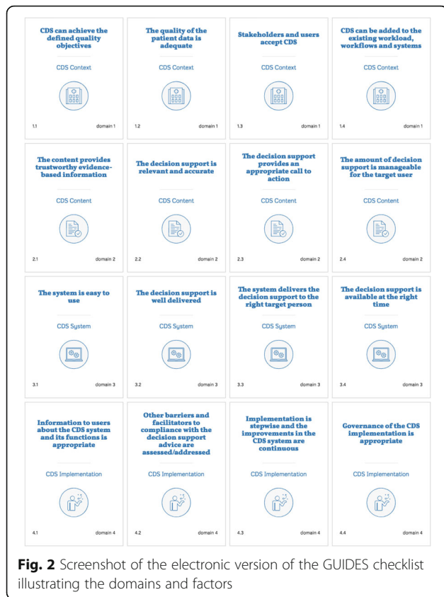
Fig. 2 Screenshot of the electronic version of the GUIDES checklist illustrating the domains and factors

would perform for the implementation of CDS in small practices, in tertiary care and in low- and middle-income countries. The experts found that the checklist was logically organised in a way that it was easy to understand (93%) and that the factors were labelled and explained in ways that were easy to understand (84%). Twenty-nine percent of the experts indicated that they felt that parts of the checklist were too complicated. Sixty-four percent of the experts found that no potentially important factors were missing. The other experts either found that some descriptions were implicit or suggested to discuss various concepts such as equitable implementation of CDS, patient involvement or use of CDS on handheld devices. Eighty-four percent concluded that the checklist did not include irrelevant factors. Some other experts pointed at interrelations or overlap between the factors. The panel noted that the checklist was suitable for people with a research background (80%). Other experts suggested further adjustments or asked data about how well the checklist achieves its purpose. Forty-two percent observed that pilot testing would be required to evaluate if the checklist is suitable for use by people who are not researchers. Ninety percent of the experts indicated that they intend to use the checklist. Other experts were uncertain, and one expert mentioned not to need the checklist given the personal expertise acquired by many CDS implementations.