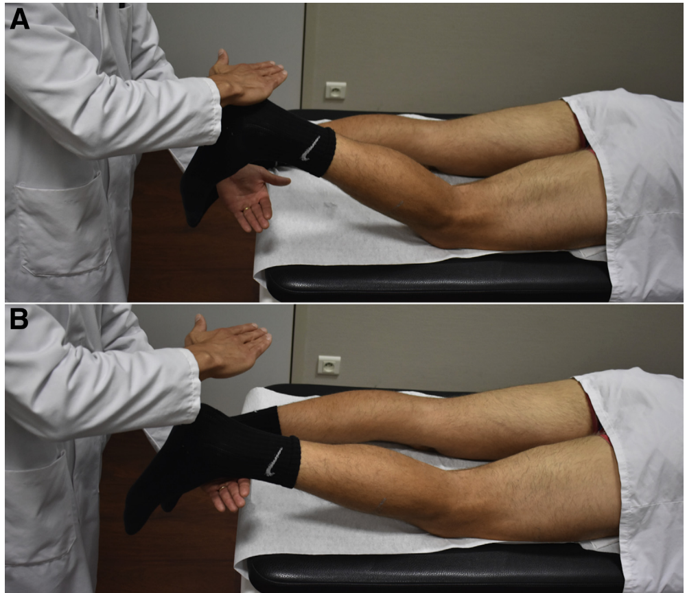
Fig 3. Hamstring fatigue. The patient is asked to repetitively contract against resistance (A) and relax the hamstrings (B). To help fully relax the hamstrings, the practitioner should gently support the foot on its way down to the examination table. A right knee is shown with the patient in the prone position.