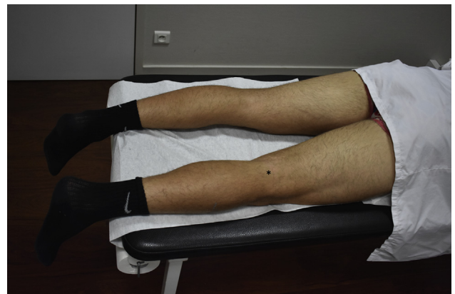
Fig 4. Full knee extension (asterisk) recovery after hamstring fatigue. A right knee is shown with the patient in the prone position.

In the semi-recumbent position, a small pillow is placed under the knee to obtain approximately 30° of flexion. This helps to allow relaxation of the