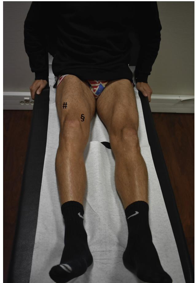
Fig 2. Right quadriceps inactivation with lack of vastus medialis contraction (section sign) and active knee extension deficit. The rectus femoris contraction (pound sign) is maintained with active hip flexion.