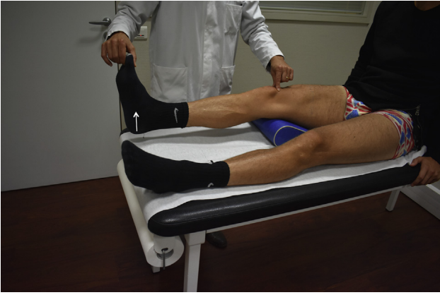
Fig 5. Passive muscle contraction of quadriceps. The patient is requested to do a heel lift (arrow) and straighten the knee. The practitioner can facilitate the movement by holding the great toe. A right knee is shown with the patient in the supine position.

hamstrings; it also allows the patient visual feedback of quadriceps contraction. Next, the patient is asked to perform heel lifts and straighten the knee. The practitioner can facilitate the movement by holding the great toe (passive muscle contraction) (Fig 5). This phase focuses on isometric quadriceps contractions. The patient is asked to contract the muscle without lifting the heel. An easy way to check the correct contraction of the muscle is to palpate the patella (Fig 6). During each contraction, the patella has to migrate proximally. If the patient only contracts the rectus femoris, the practitioner will observe a muscular contraction of the thigh without any movement of the patella. Once the patient is able to reliably contract the vastus medialis, the thickness of the pillow placed under the knee is progressively reduced until it can be removed completely and the patient can still show good contraction.