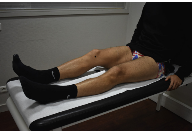
Fig 1. Knee extension deficit evaluation of right knee (asterisk) with patient in supine position.

After identification of quadriceps activation failure, the patient is placed prone on the examination couch. In this position, side-to-side palpation of the hamstrings allows determination of the presence of muscle contracture. If a hamstring contracture is not present, this should raise the suspicion that the extension deficit does not result from AMI and the differential diagnosis of a locked knee should be considered further.