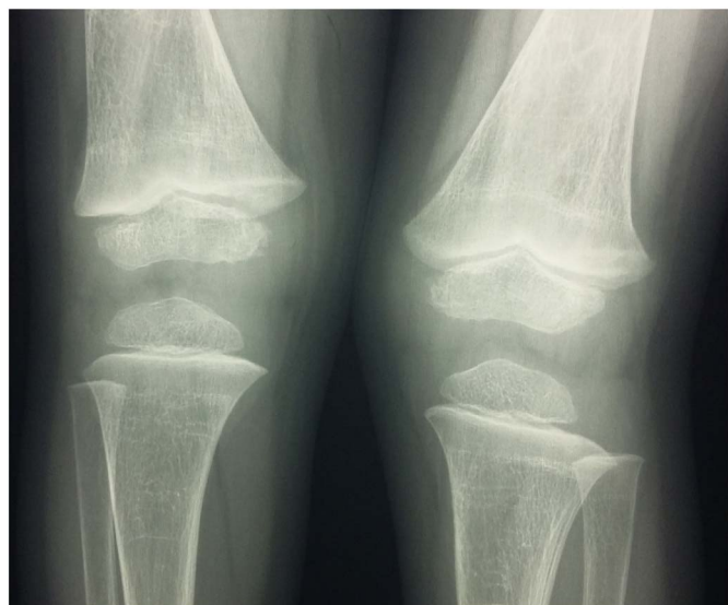
Fig. 3. Radiological findings at the knees showing slight increased width of the growth plate at distal ends of right and left femurs.