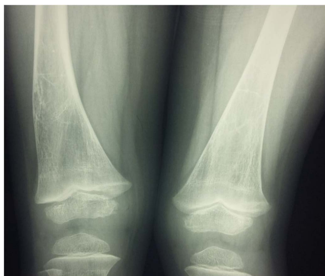
Fig. 4. Bowing of right femur and possibly an old healed fracture at the distal midshaft femur with coarsened trabeculae and osteopenia.

factors for vitamin D deficiency and nutritional rickets relate to those factors which reduce sunlight (UV radiation) exposure, such as duration and extent of skin exposure, season of the year, latitude, air-pollution,