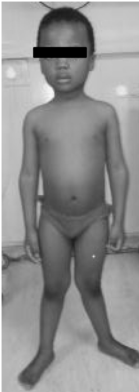
Fig. 1. The index patient presented with genu valgus deformities of the lower limbs at the age of 4 years.

Nutritional rickets remains a global public health concern, particularly in a number of lower–middle income countries (LMIC) and among at-risk immigrant communities in resource rich countries, as has been highlighted by a recent international consensus statement (Munns et al., 2016), despite a greater understanding of the etiology and pathogenesis of the condition. Vitamin D deficiency has generally been considered to be the primary cause of nutritional rickets, however more recent research into dietary calcium deficiency has now provided clinicians with reasons to investigate and manage patients with nutritional rickets differently. Although vitamin D deficiency is probably the commonest cause of nutritional rickets globally, dietary calcium deficiency has been identified as a common cause of nutritional rickets in a number of developing countries (Pettifor, 2014).