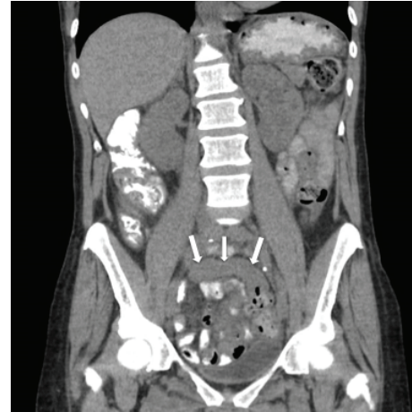
FIGURE 2: Rectosigmoid colonic wall thickening again demonstrated with white arrows at the site of stricture.

Two months after ED presentation, she returned to the ED complaining of nausea, vomiting, and abdominal pain. She had diffuse tenderness and voluntary guarding, but no rebound tenderness. No palpable masses were appreciated. Abdominopelvic CT showed diffuse colonic wall thickening and lymphadenopathy (Figures 1 and 2).