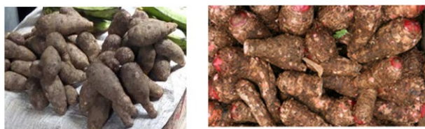
Cormels of different varieties of Xanthosoma sagittifolium