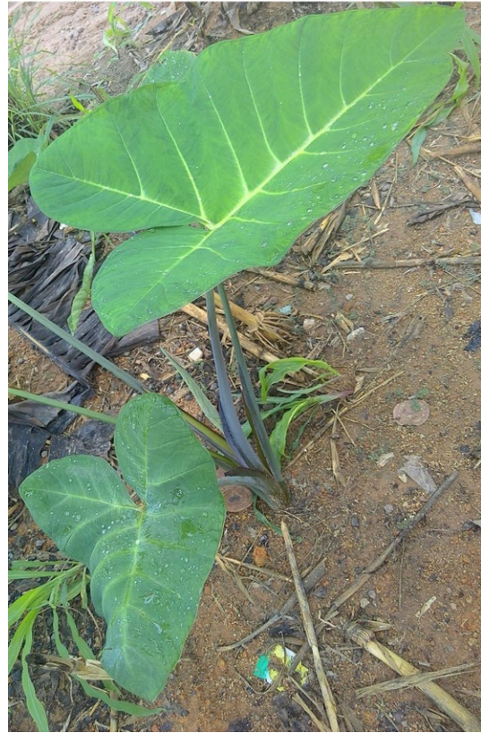
FIGURE 2 A young Xanthosoma sagittifolium (L.) Schott plant.

However, there were no concerted efforts to promote the growth and performance of cocoyam relative to other root and tuber crops until the outbreak of the root rot complex disease in 1925 after which two formal studies on the species were conducted in Ghana (Doku, 1966; Wright, 1930). There was a lack of information and follow-up studies on domesticated varieties until 1971 when Karikari carried out a germplasm assessment and collection (Karikari, 1971). This was then followed with an evaluation of the susceptibility of local and exotic varieties to the root rot complex disease (Karikari, 1979). Similar individual studies were also carried out (Offei, Asante, & Danquah, 2004; Opoku-agyeman et al., 2004; Safo-Kantanka & Adofo, 2007; Tortoe & Clerk, 2011) but with an absence of a common front to purposefully enhance the growth and performance of cocoyam (Quaye et al., 2010; Ramanatha et al., 2010).