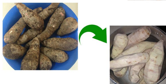
Peeled cormels of Xanthosoma sagittifolium