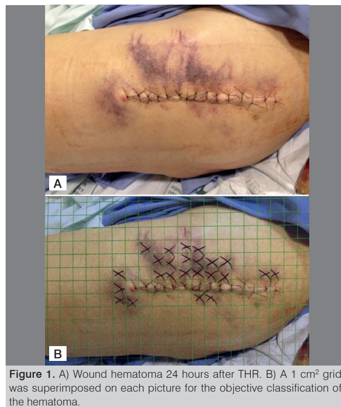
Figure 1. A) Wound hematoma 24 hours after THR. B) A 1 cm 2 grid was superimposed on each picture for the objective classification of the hematoma.

The following example shows how the formula was used for the calculation of the real hematoma area. Data were collected