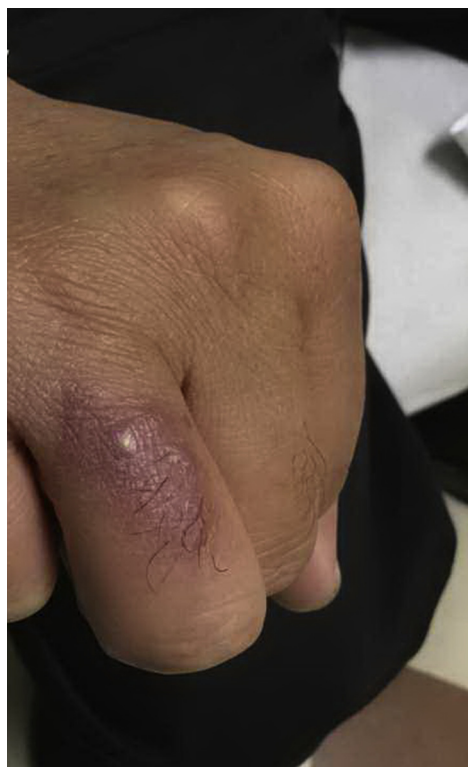
Fig 3. Erythematous plaque on right dorsal ring finger.

rainfall, which California experienced this year. Additionally, there have been recent reports of patients in eastern Washington state who acquired coccidioidomycosis without any travel history. 11,13 Subsequent studies of soil samples collected in that region confirmed the presence of C immitis , reflecting the changing demographics of endemic diseases in the United States. 14,15