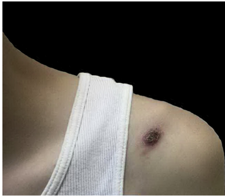
Fig 1. Ulcerating erythematous nodule on the left anterior shoulder.

Chest radiograph ruled out pulmonary disease, and the diagnosis of primary cutaneous coccidioidomycosis was made. He was started on fluconazole, 200 mg twice a day, and had significant improvement of his skin lesions at follow-up.