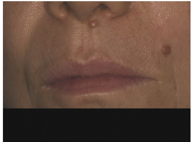
Fig. 2. Two inconspicuous skin-tone dome-shaped cutaneous lesions suspected to be Melanocytic BAP1-mutated Atypical Intradermal Tumor (MBAIT) (Bapoma) in a 36-year-old woman with uveal melanoma (UM), germline BRCA1-associated protein-1 (BAP1) mutation and family history of skin melanoma.

Rai et al. reported 174 patients with germline BAP1 mutation and found that 130 (75%) developed at least one of the