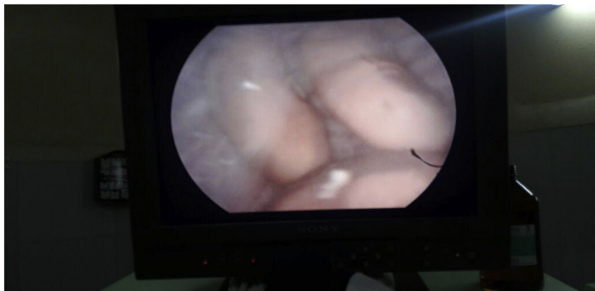
Fig. 2. Cystoscopic view showing kidney beans in urinary bladder, 4 in number. The kidney beans are intact and swollen due to imbibition of urine.

The patient was admitted and cystoscopy was done. On cystoscopy the urethra was found to be normal, cystoscopy showed the presence of 4 kidney beans floating in the lumen of bladder (Fig. 2). The kidney beans were intact soaked in urine and swollen. Due to non-availability of stone punch forceps, triprong forceps was used to attempt the removal of the beans. While removing the beans with the forceps the outer covering of the beans was getting sloughed off but the beans could not be crushed. Hence procedure was abandoned and decision of an invasive or open procedure was taken up. Patient was catheterized by using a Foley's Catheter of 16 French size. The bladder was filled through the catheter and the catheter was clamped. A 5mm incision was given over the bladder, 2 cms above to the pubic symphysis. Cystoscope was inserted from this incision. Cystoscope removed and tract was dilated till 30ch/Fr and kidney beans withdrawn with the help of triprong forceps. Due to imbibition by urine the beans got softened and swollen and hence got broken during withdrawal by using triprong