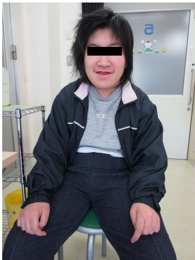
Figure 1 The present patient, a 29-year-old female.

At the age of 27 years, she suddenly became inactive and began neglecting her regular household chores. She refused to go to work and became withdrawn; she did not watch television, an activity she previously enjoyed. She was expressionless, was unkempt, and had stopped eating and bathing by herself. She suffered from insomnia, and her mood was unstable, irritable, and aggressive. She developed sluggish movements; talked to and laughed at herself; occasionally cried, shouted, and got irritated; and distressed her family.