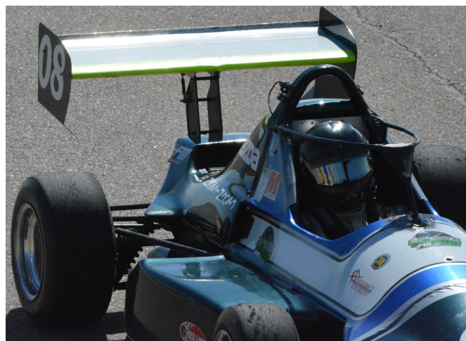
Figure 1 Driver's head position during the simulation with the halo-type structure fitted showing right lateral flexion on approach to a right-hand corner.

experience racing open-cockpit (Formula) cars at national level. The halo-type structure was custom fabricated on-site from circular steel tube with an outside diameter of 16.7 mm. This diameter was chosen to resemble the predicted diameter of the final design specification for the Formula 1 halo as closely as possible (Presenting the facts behind Halo, press release, 2017). The main hoop of the halo-type structure was mounted to the vehicle's main roll bar located directly behind the cockpit. It extended forwards 812 mm to the central pillar which was mounted to the front roll bar. The central pillar was swept back at an angle of 53°. The triangle at the intersection of the main hoop and the central pillar had a width of 113 mm at the top tapering to 17 mm at the base and a side length of 128 mm. The halo-type structure used was a mock-up intended to provide a training stimulus. The dimensions of the FIA homologated halo are only available to manufacturers. 9 Moreover, each team is permitted to modify non-structural elements of the halo to improve aerodynamic performance (Presenting the facts behind Halo, press release, 2017). Consequently, each halo is essentially unique. Indeed, it may even change from race to race as the teams update their aerodynamic package. This makes it problematic