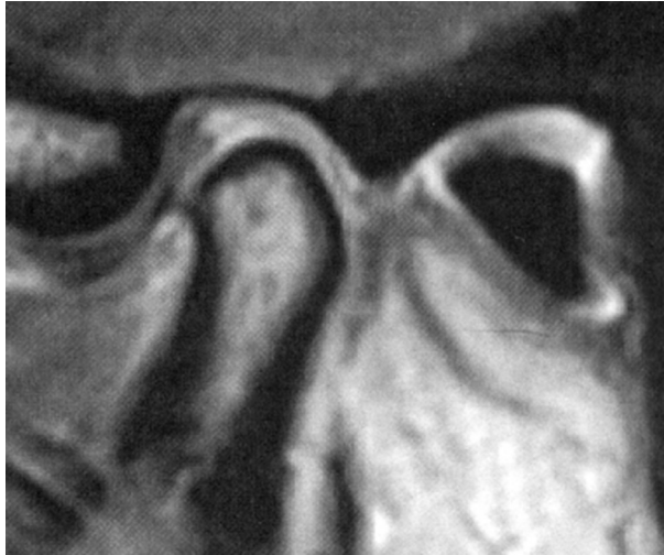
Fig. 1. MRT-image: Anterior disc displacement.